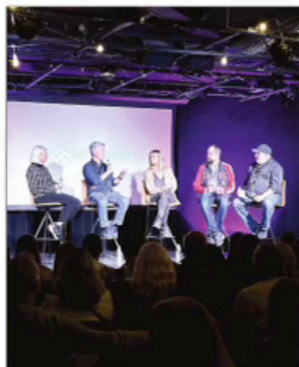
Last year's comedy panel at 35 Artspace in Portsmouth.