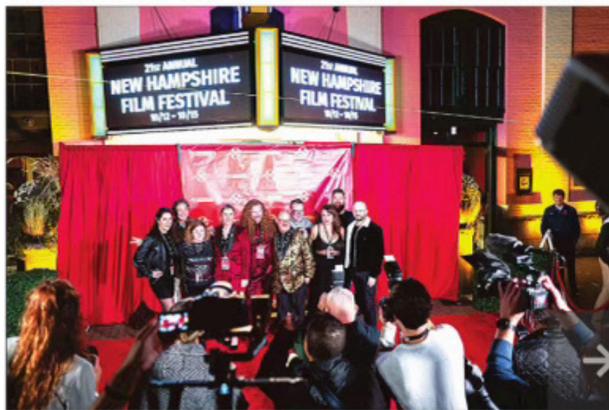
The scene from the red carpet at the 2023 New Hampshire Film Festival. Film buffs can choose to have their photo taken on the red carpet.